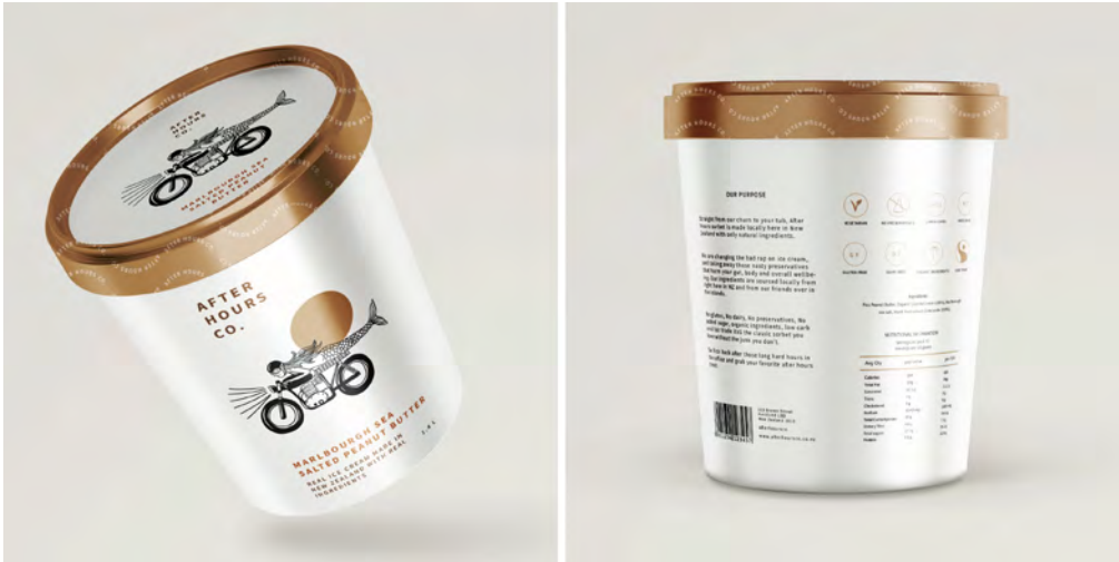
Left Jafar Woods Right Alexa McKay

Further study options Level 4 Certificate in Arts + Design Level 7 Bachelor of Design + Digital Media Level 7 Bachelor of Fine Arts (Fine Arts / Photo Media) Level 7 Bachelor of Sustainable Fashion Design